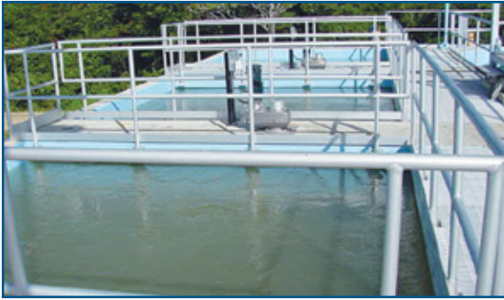
Flocculators Belize Central America