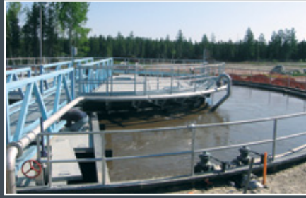
Circular Extended Aeration Geraldton, Canada