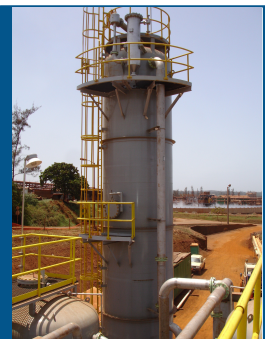
Vacuum Degasifier Moa Nickel Cuba