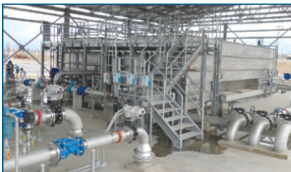
Water Treatment Plant Quito Ecuador