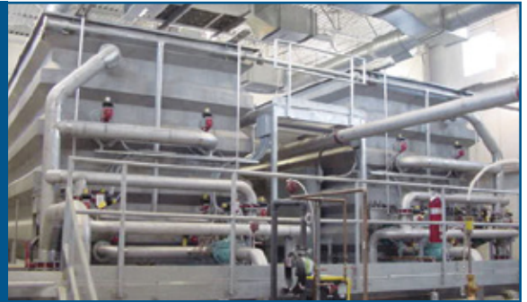
Gravity Filter Trains Limoges Canada