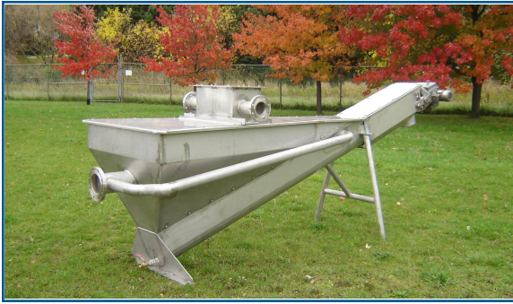
Screw Grit Classifier Orangeville Canada