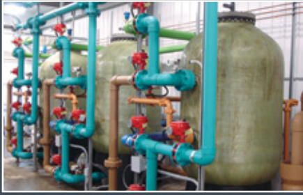
Pressure Filters Rolling River, Canada