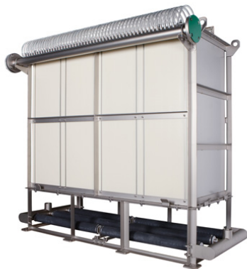
Membrane Bio-Reactor Module