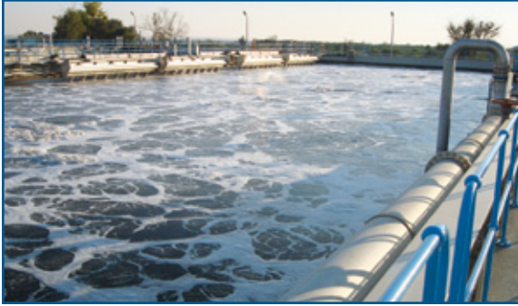
Bio-Batch™ SBR Abu Dhabi UAE