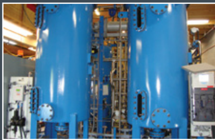
Ion-Exchange Demineralization System Moa Nickel, Cuba