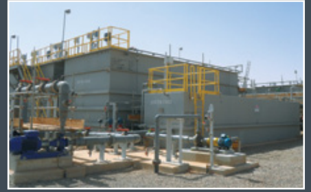
Package BIO-BATCH™ SBR Mauritania