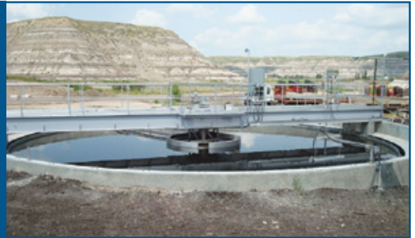
Primary Clarifier Drumheller Canada