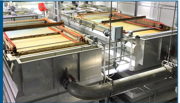
DI-FLOAT™ DAF Deseronto, Canada