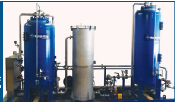
Package Demineralized Water System Middle East