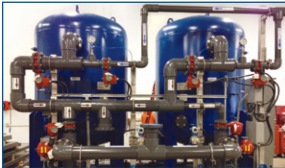
Pressure Filtration System Rocky Rapids Canada