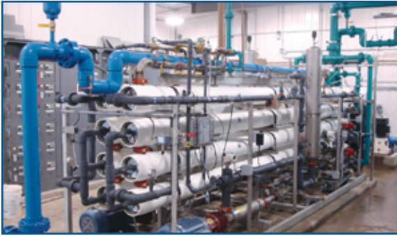
Nanofiltration System Rolling River Canada