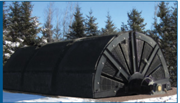
Bio-Rotor™ RBC Coalburn Canada