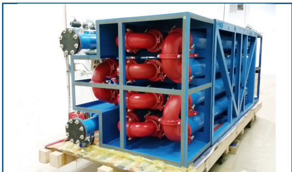
BIO-HTX™ Sludge Heat Exchangers Corbett Creek Canada