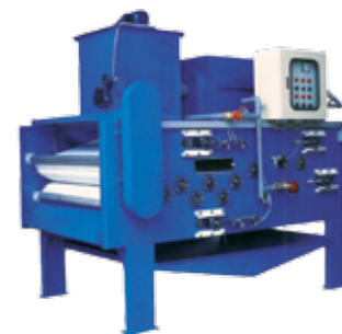
Belt Filter Press Morley Canada