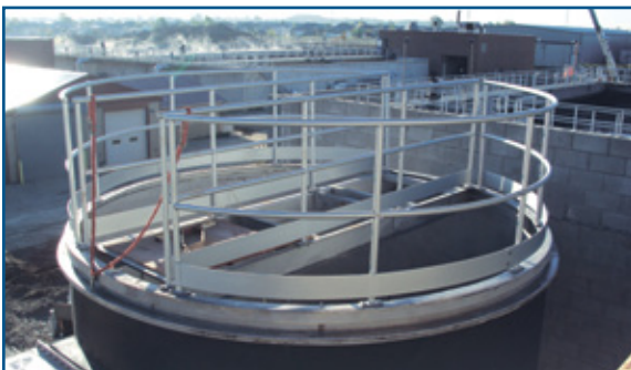
Vortex Grit Removal System Belle River Canada