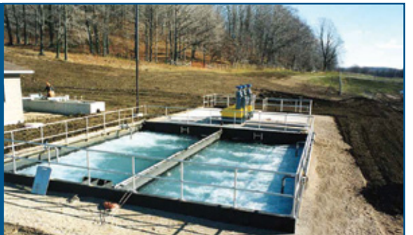
Extended Aeration Plant Flesherton Canada