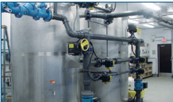
GAC Contactors Balsam Lake Canada