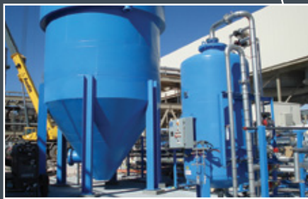
BIO-ROTOR™ RBC Quito, Ecuador