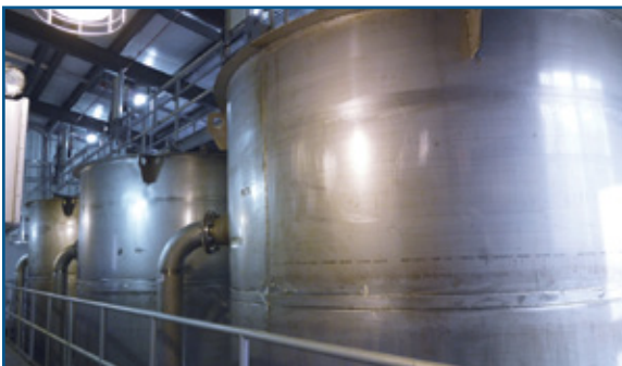
Continuous Backwash Filter Mount Brydges Canada