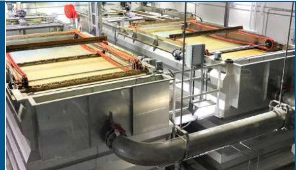
DI-FLOAT™ DAF Deseronto, Canada