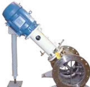
Inline Rapid Mixer Rocky Mountain House Canada