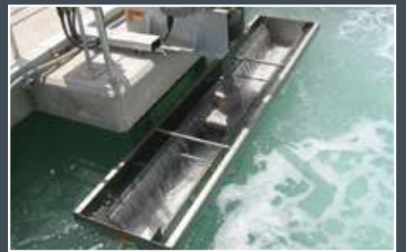
BIO-BATCH™ SBR Wafra, Kuwait