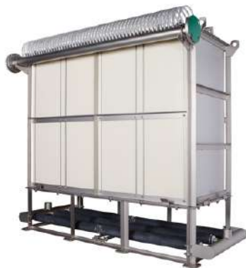
Membrane Bio-Reactor Module