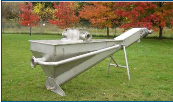
Screw Grit Classifier Orangeville Canada