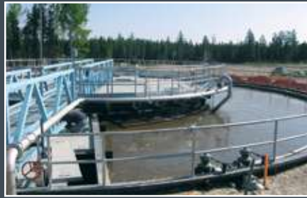
Circular Extended Aeration Geraldton, Canada