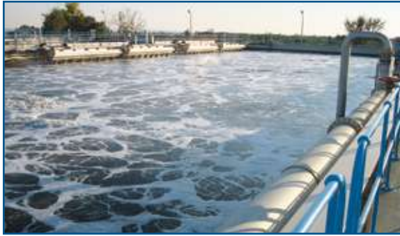
Bio-Batch™ SBR Abu Dhabi UAE