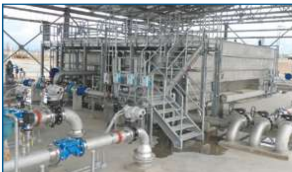
Water Treatment Plant Quito Ecuador