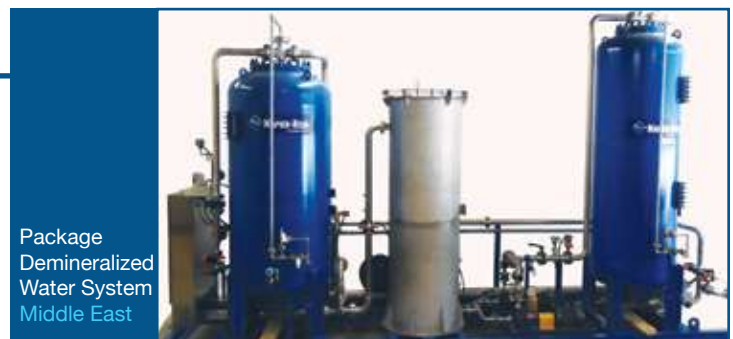
Package Demineralized Water System Middle East