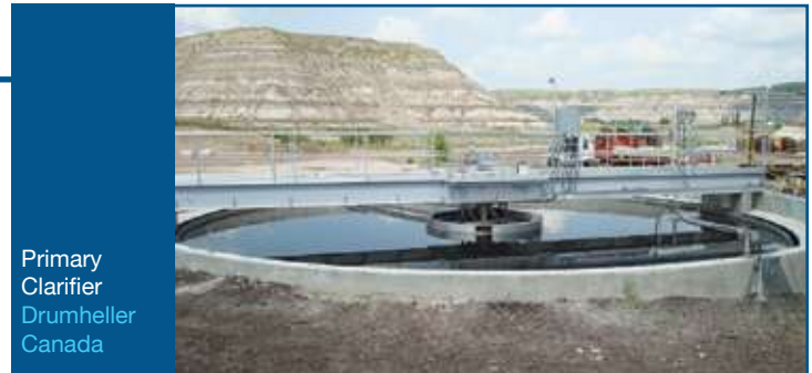
Primary Clarifier Drumheller Canada