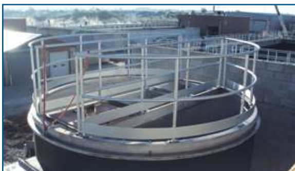
Vortex Grit Removal System Belle River Canada