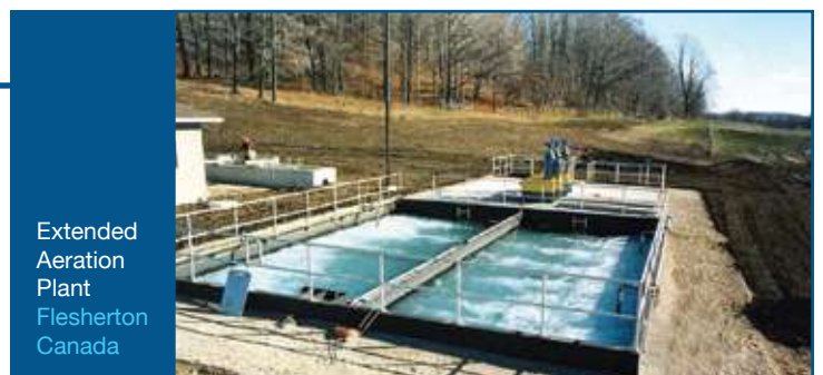
Extended Aeration Plant Flesherton Canada