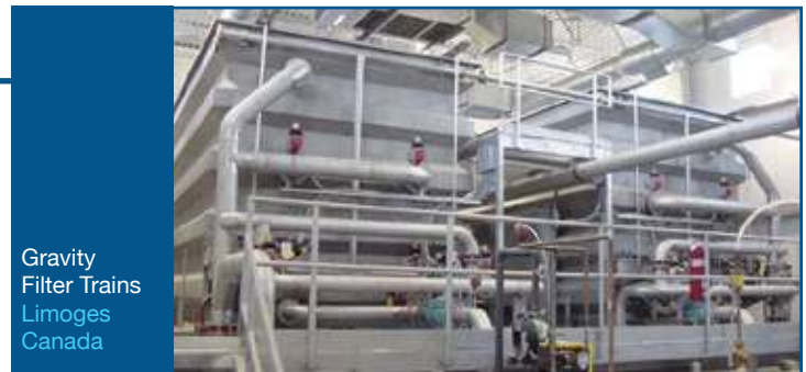
Gravity Filter Trains Limoges Canada