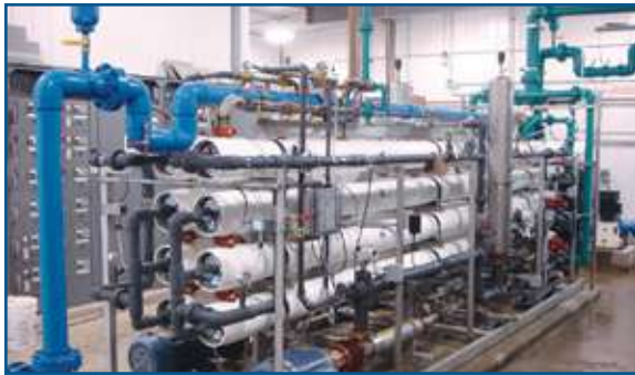
Nanofiltration System Rolling River Canada