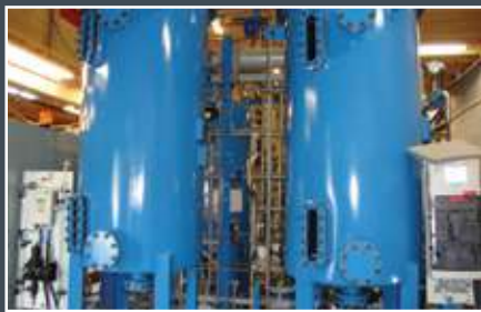
Multimedia Filtration System Pueblo Viejo, Dominican Republic