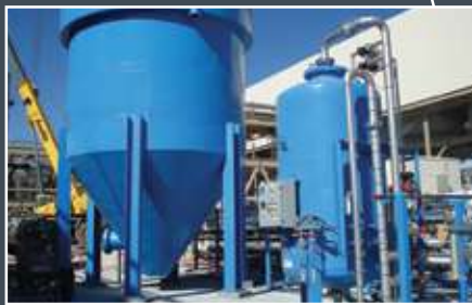
Solids Contact Clarifier La Mesa, USA