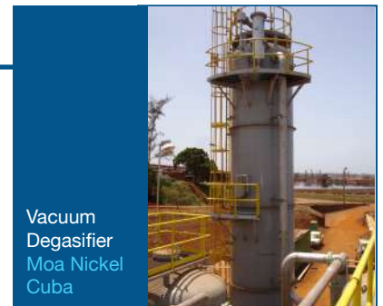
Vacuum Degasifier Moa Nickel Cuba