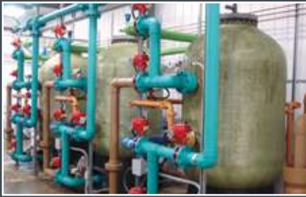
Pressure Filters Rolling River, Canada