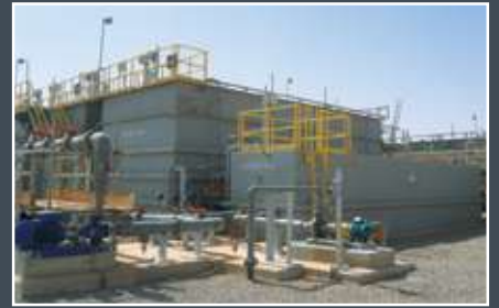
Package BIO-BATCH™ SBR Mauritania