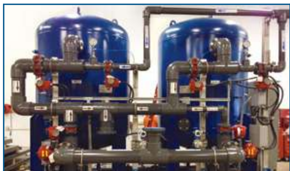
Pressure Filtration System Rocky Rapids Canada