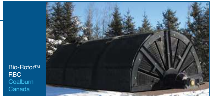
Bio-Rotor™ RBC Coalburn Canada