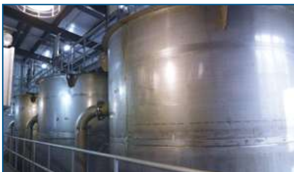
Continuous Backwash Filter Mount Brydges Canada