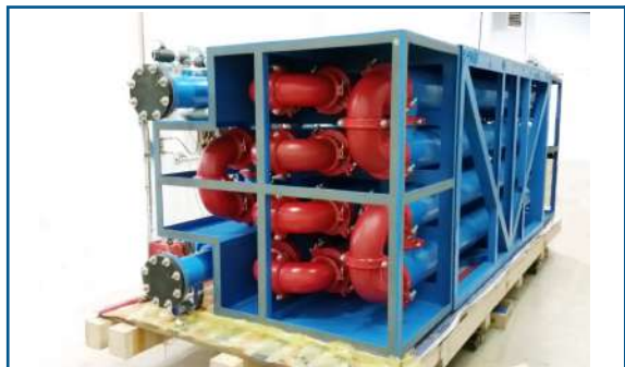
BIO-HTX™ Sludge Heat Exchangers Corbett Creek Canada