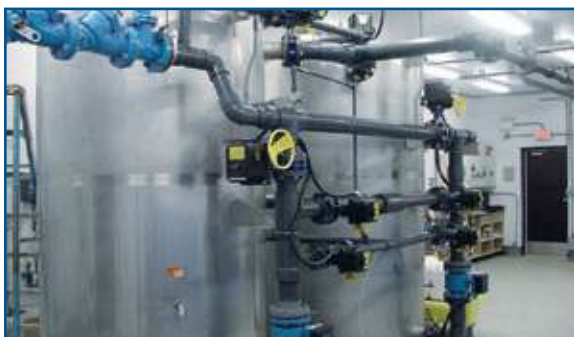
GAC Contactors Balsam Lake Canada