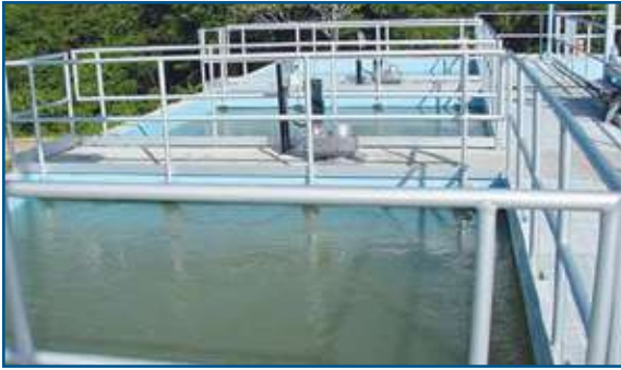
Flocculators Belize Central America